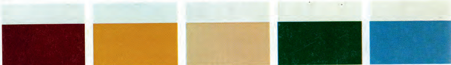
Pastel White Chianti Red