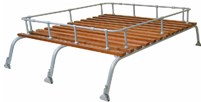
3. The finished job!

3. Finally all that remains is to bolt on the rest of the wooden slats, add the top bars that you made up in step 2 and then cut and stick the self adhesive rubber onto the feet to protect your vans gutters.