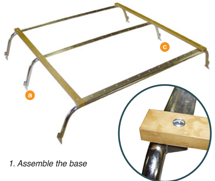
1. Assemble the base

Use a tape measure to avoid mounting the central bow the wrong way round and do not tighten the bolts fully.