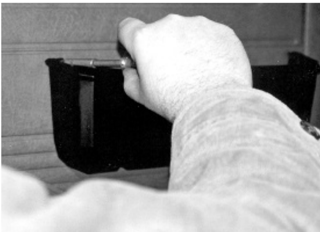
3. Mount pocket with screws