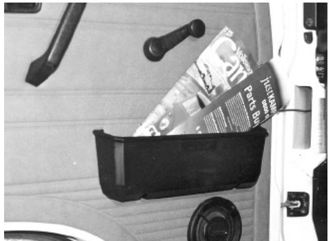
4. Finished job

N.B. Whilst every attempt is made to ensure that these instructions are as accurate and clear as possible, we cannot be held responsible for misinterpretation of these instructions or for any subsequent accident or damage caused through mis-fitted parts.