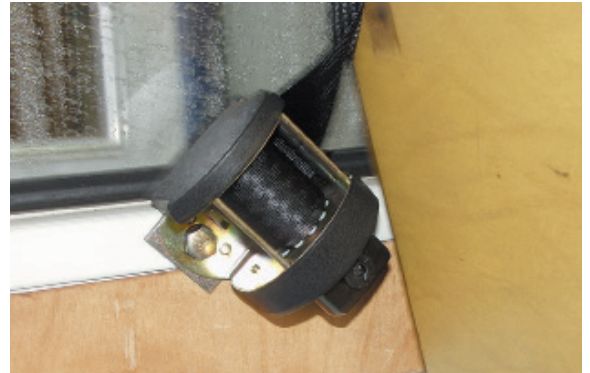
2. Inertia reel seat belts

NOTE: If you have any doubts about fitting, contact a reputable garage