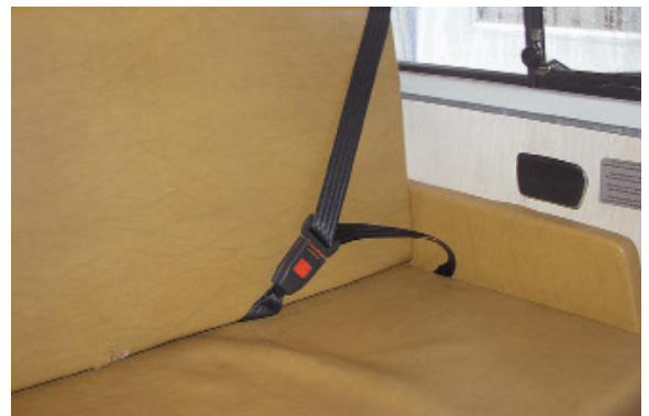
4. Cushions must be well secured

N.B. Whilst every attempt is made to ensure that these instructions are as accurate and clear as possible, we cannot be held responsible for misinterpretation of these instructions or for any subsequent accident or damage caused through mis-fitted parts.