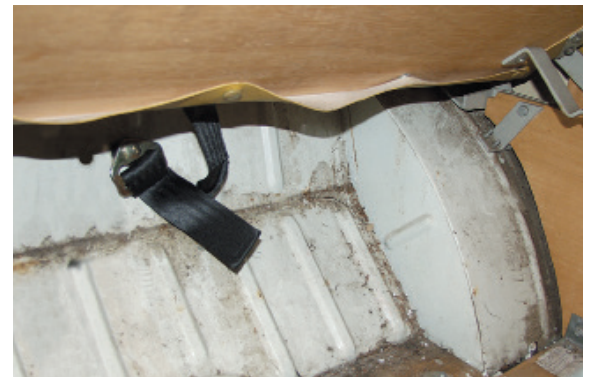
3. Non standard mounting in rear bulkhead